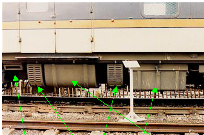
Equipment Fuse, Line breaker case, Main equipment case, battery contactors, Camshaft