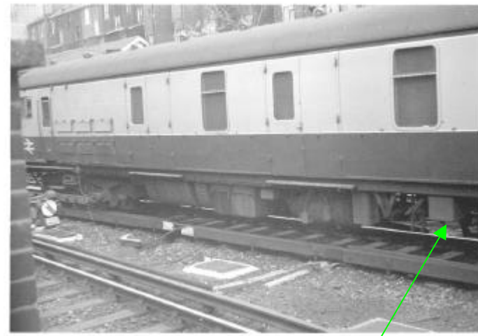
Class 419 MLV (trailer end) Original one brake cylinder version with one EP Brake Unit