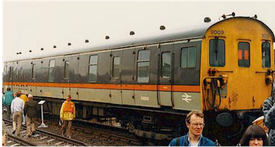
Class 419 MLV (trailer end)