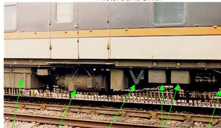
Camshaft, 200v MG, Handbrake rigging, 2x EP Brake Units, air strain