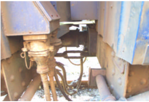
Close-up of buffer arrangement