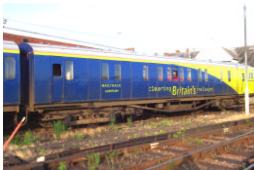
Second man's side No.1 vehicle