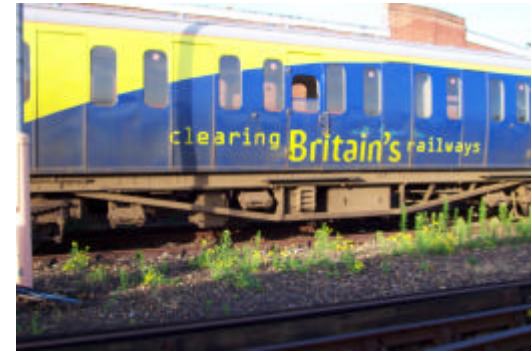
Driver's side No.2 vehicle