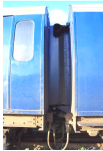
Gangway, power jumper side