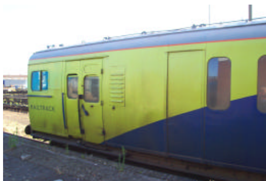
No.1 vehicle Driver's side