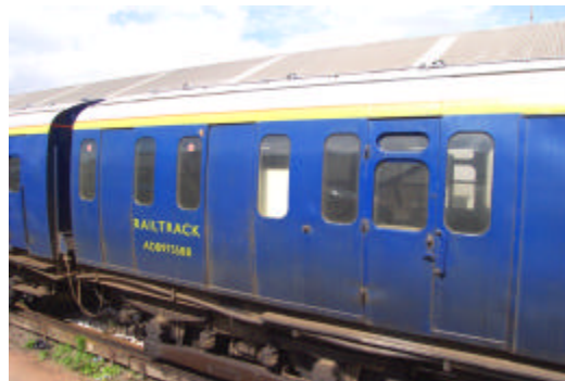
No.2 vehicle secondman's side