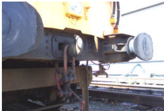
Nose end screw coupling & buffers