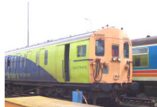
Second man's side No.1 vehicle