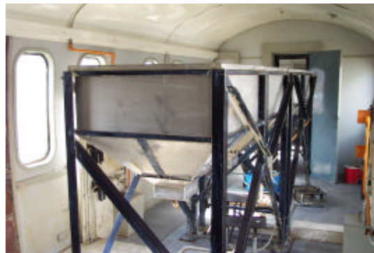
Sandite hoppers in No.2 vehicle