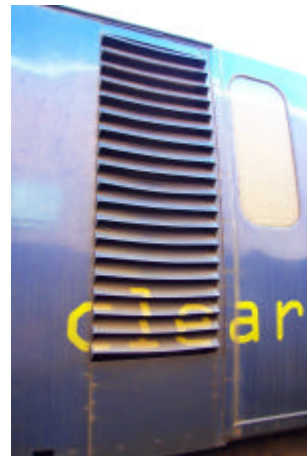
Louvre panel on No.2 vehicle secondman's side