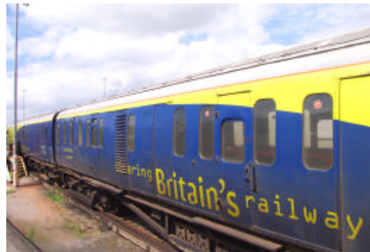
No.2 vehicle secondman's side