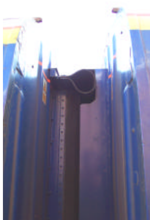
Gangway top, control side