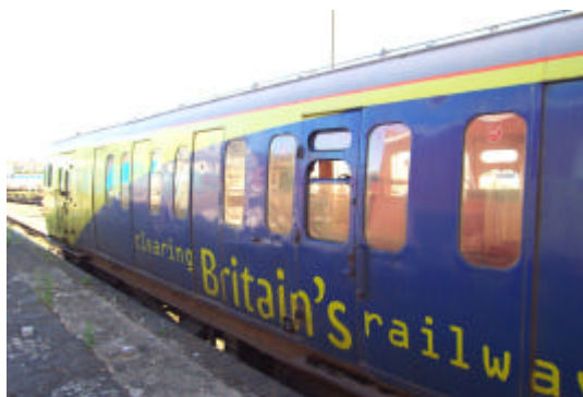
No.1 vehicle Driver's side