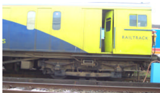
Second man's side No.1 vehicle