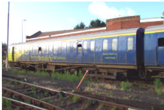
Driver's side No.2 vehicle