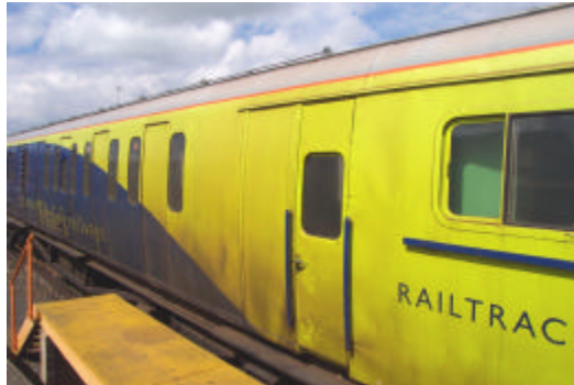
No.2 vehicle secondman's side