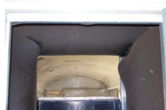
Interior of inter vehicle gangway