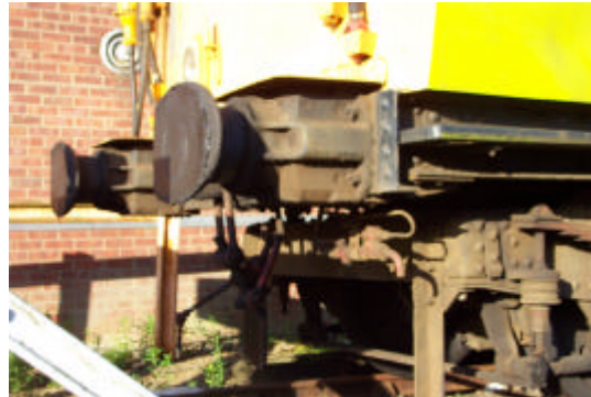
Buffers etc. No.2 end