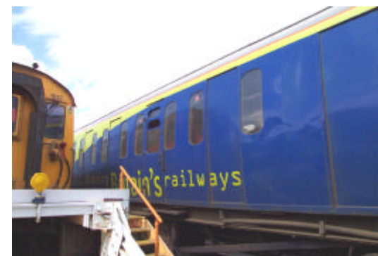
No.1 vehicle Driver's side