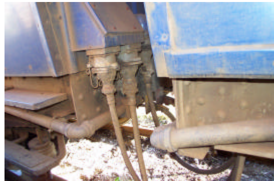
Close-up of control jumpers