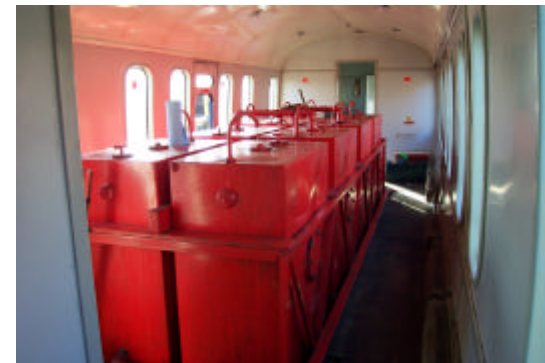
De-Icer tanks in No.1 vehicle