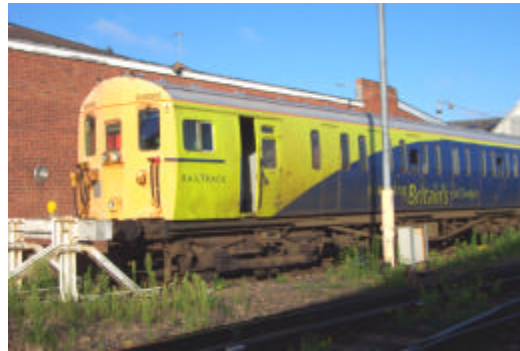
Driver's side No.2 vehicle