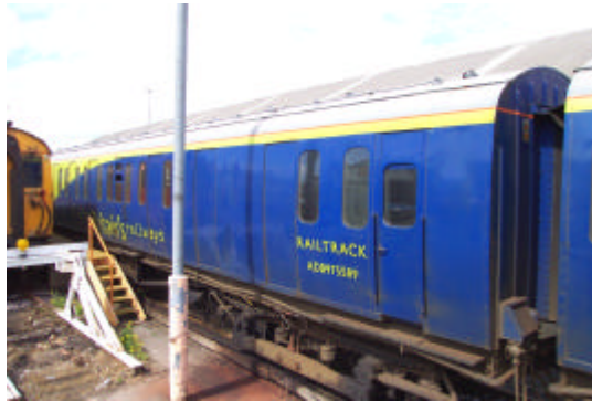
No.1 vehicle Driver's side