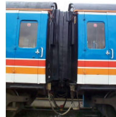
Connection between TBCK & DMSA Power side