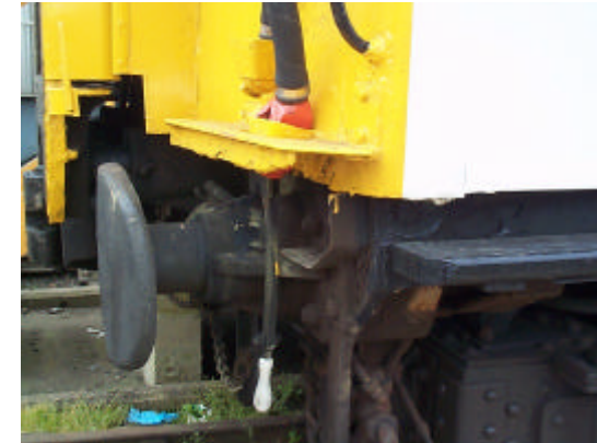
Buffer and coupling release