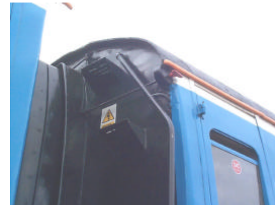
End steps & Pass.Comm.Mech. Normal gangway shroud