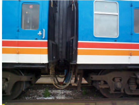
Connection between DMSB & TSL Control side