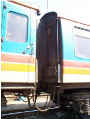
End nearest DMS