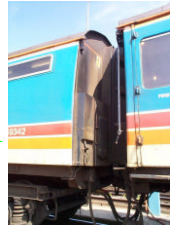
End nearest TBCK