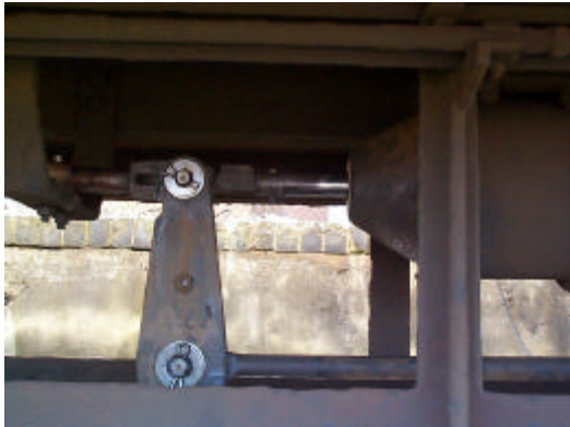
Brake Cylinder piston crosshead