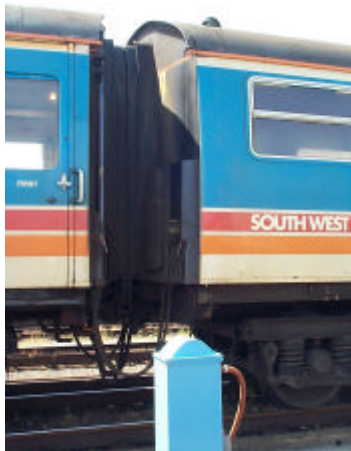
End nearest TBCK