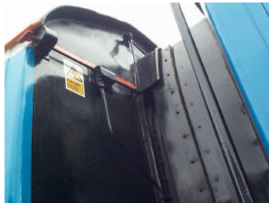
Pass.Comm. Valve & Mech. Cut back gangway shroud