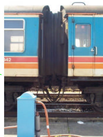
End nearest DMS