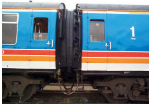
Connection between TSL & TBCK Power side