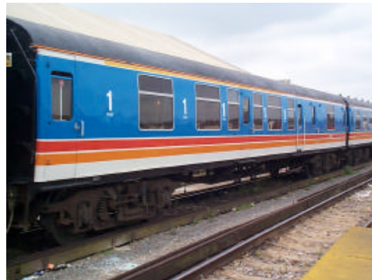
TBCK Corridor side